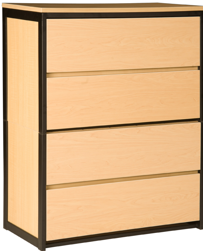
G. FOUR DRAWER UNSTACKABLE - 44649