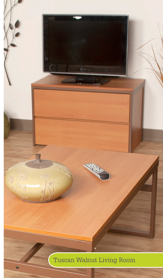
Tuscan Walnut Living Room

All products shown here are available with various wood, laminate and metal finish options. Our sales representatives are available to work with you in planning which look is best for your space.