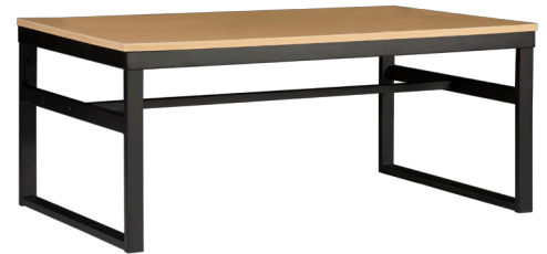
D. COFFEE TABLE - 44562SKD