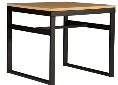
E. END TABLE - 44560SKD