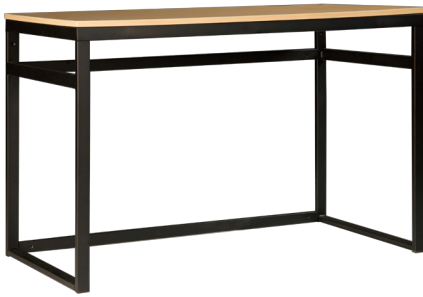
B. TABLE DESK - 44973SKD