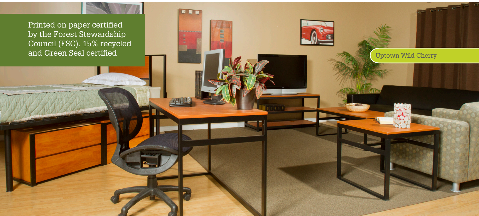
Uptown Wild Cherry

Printed on paper certified by the Forest Stewardship Council (FSC). 15% recycled and Green Seal certified