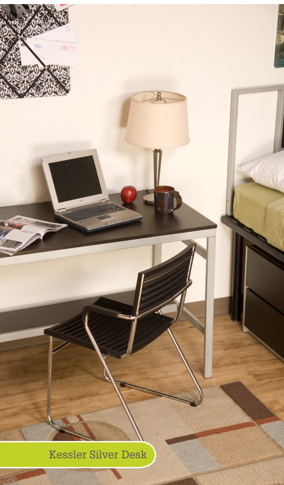
Kessler Silver Desk