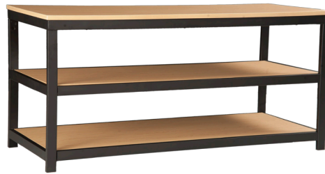
C. ENTERTAINMENT CENTER - 44764SKD