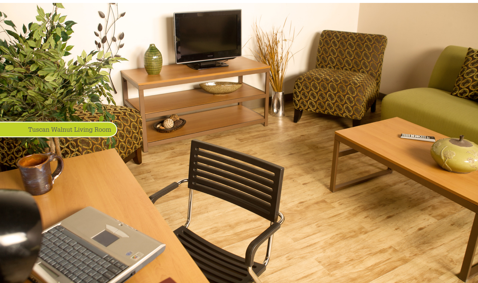
Tuscan Walnut Living Room