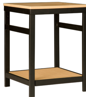
F. NIGHTSTAND - 44568SKD